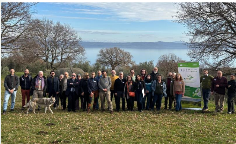
The Italian RAIN bases on the stakeholder community (farmers, extenders, multipliers, researchers and policy makers) acting within the Bolsena Lake Biodistrict

Within this framework, IRET elaborates the guidelines to identify (1) the RAIN management procedures; (2) the RAINs governance structure, (3) the role and activities of the Innovation Broker, (4) the involvement of actors/stakeholders in each RAIN, (5) the composition, objective and timing for each RAIN workshop and (6) the thematic issues to be addressed by validating and extending the most promising land management innovations collected in AFINET towards the development of business models